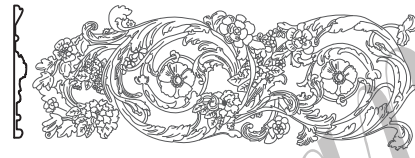
RMF 2075 RINCEAU 8-1/2"H x 3/4"D x 24"L